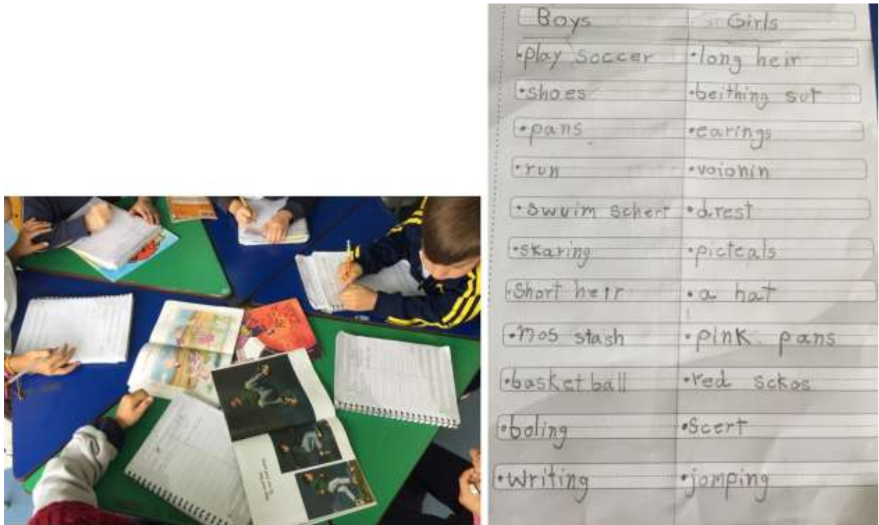
Figure 5. Students investigating gender roles in the class library picturebooks (left) and Mari Mar's list of how the books portrayed boys and girls (right).

describe in more detail with the following category that is based on students exploring the multiple perspectives of texts.