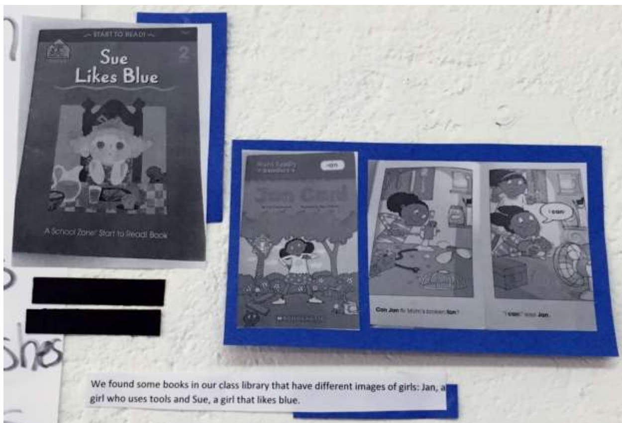
Figure 6. Two books students discovered in our classroom library that disrupted the common portrayals of girls in picturebooks. (Taken from our class audit wall.)