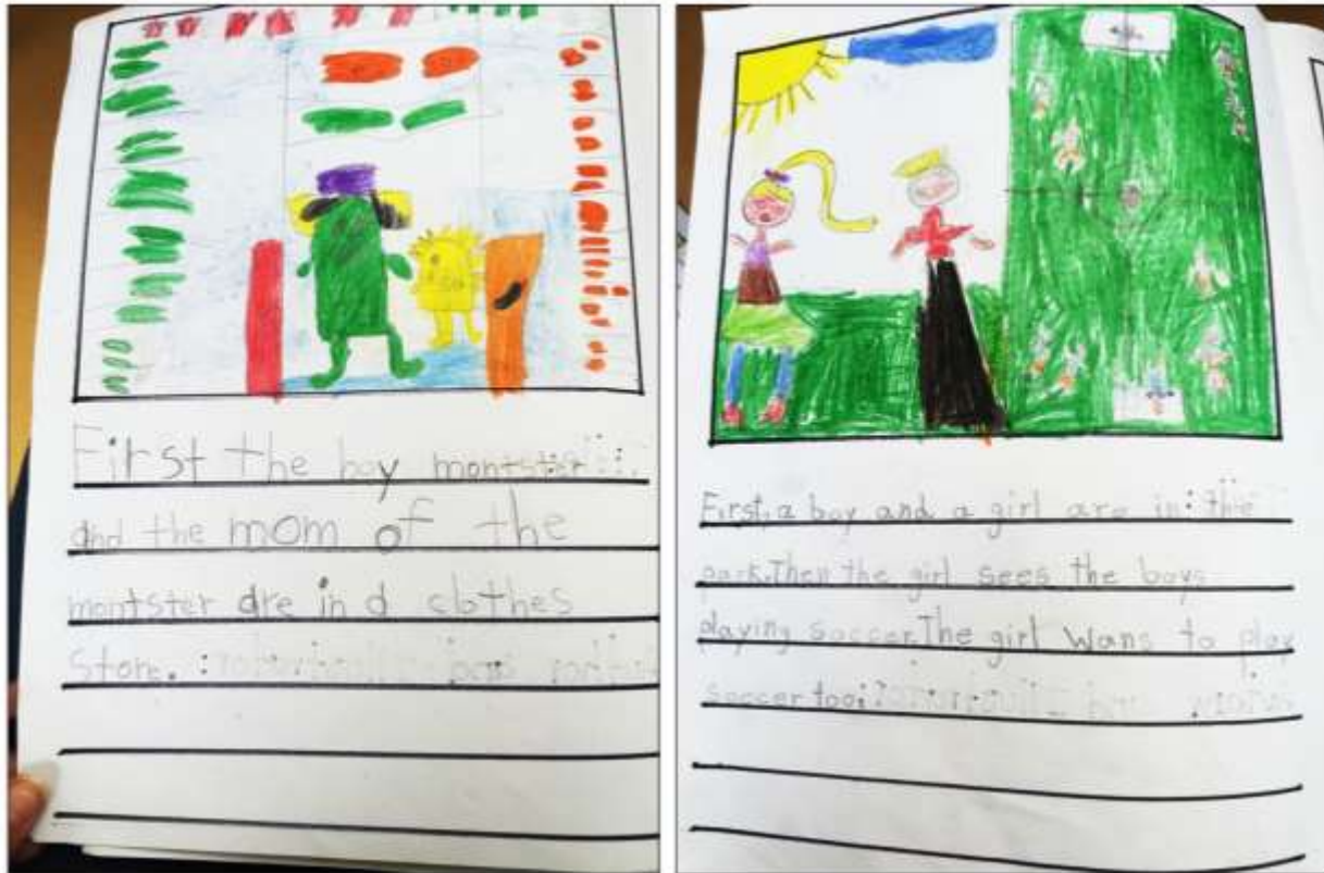
Figure 14. Excerpts from students' stories that break gender stereotypes.

Allowing the EL children to read, listen to and explore picturebooks with a critical literacy perspective helped them to understand the power of words, more importantly, the power of their own words. The children's new sense of empowerment took their reading experiences into a realm where they felt comfortable questioning and reimagining the worlds portrayed in books. Their new reading experiences also developed in them an innate desire, or feeling of responsibility, to take action in order to change what they understood as unfair in the words of the books they read and in their worlds.