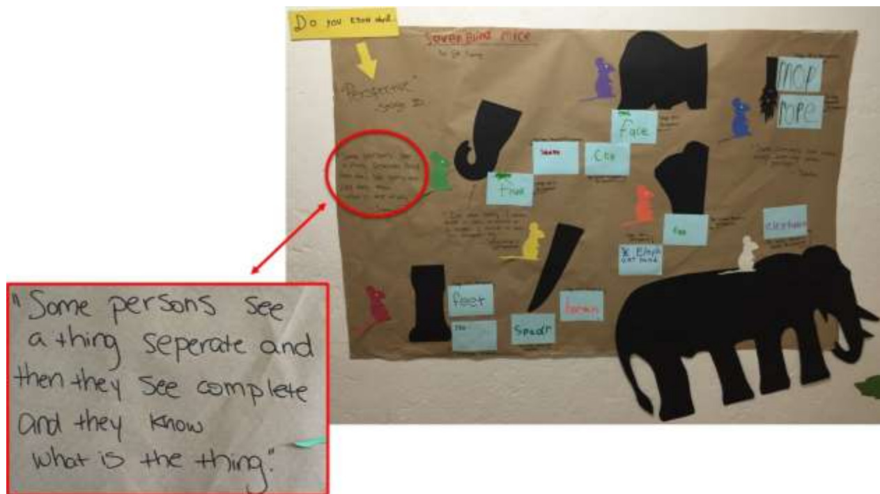
Figure 7. Seven Blind Mice class bulletin board and Sammy’s definition of “perspective”.

Lionel defined it in the following terms, “Is when somebody thinks of a thing but other does not think the same” (Observation, 4/6/2016).