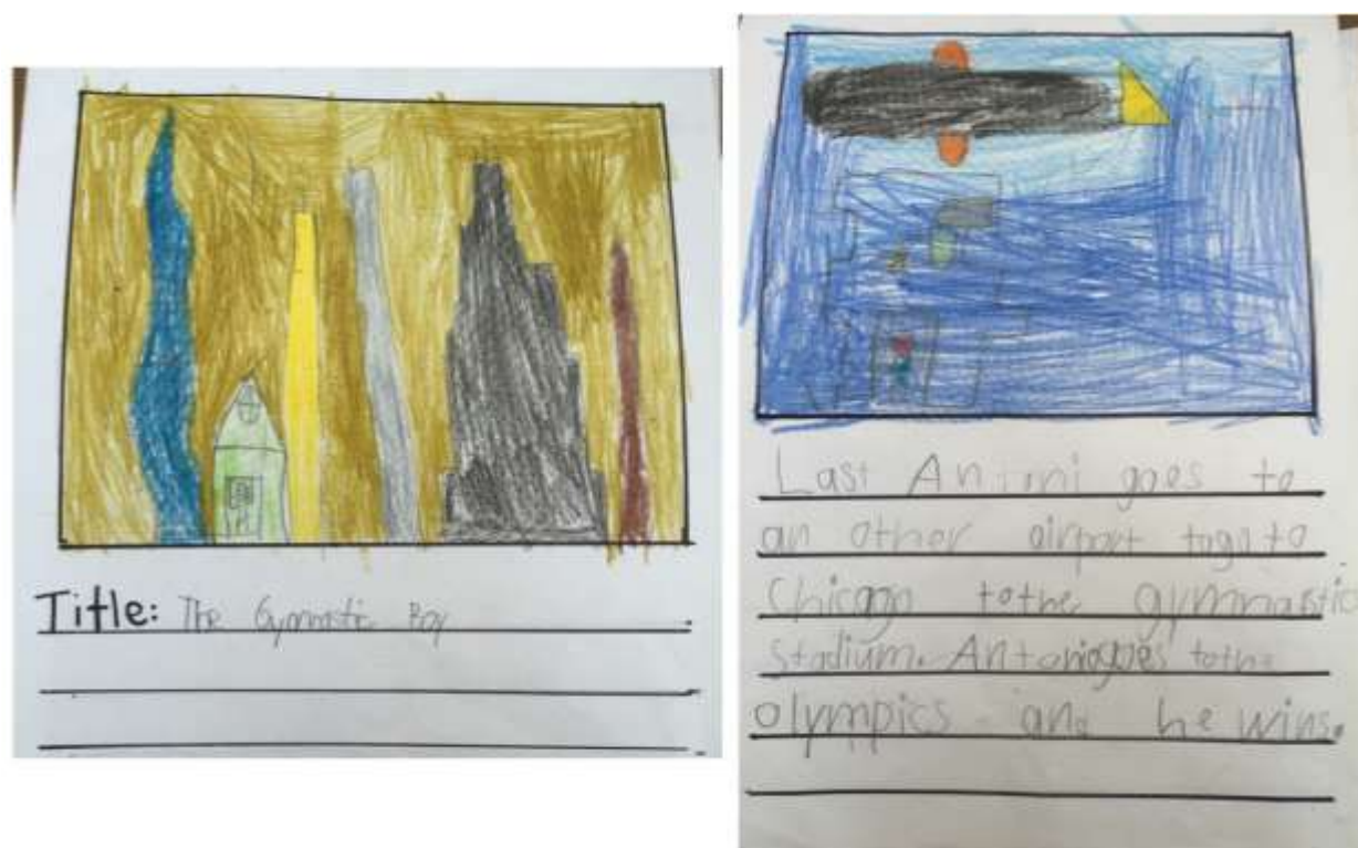
Figure 3. Example of student connecting his words to his world.