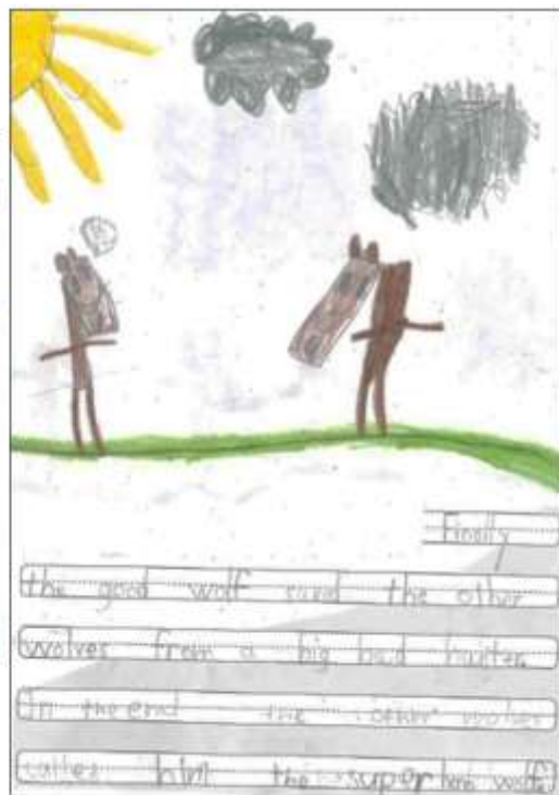
Figure 11. Excerpts from Lionel and Andres' good wolf story, The Superhero Wolf .