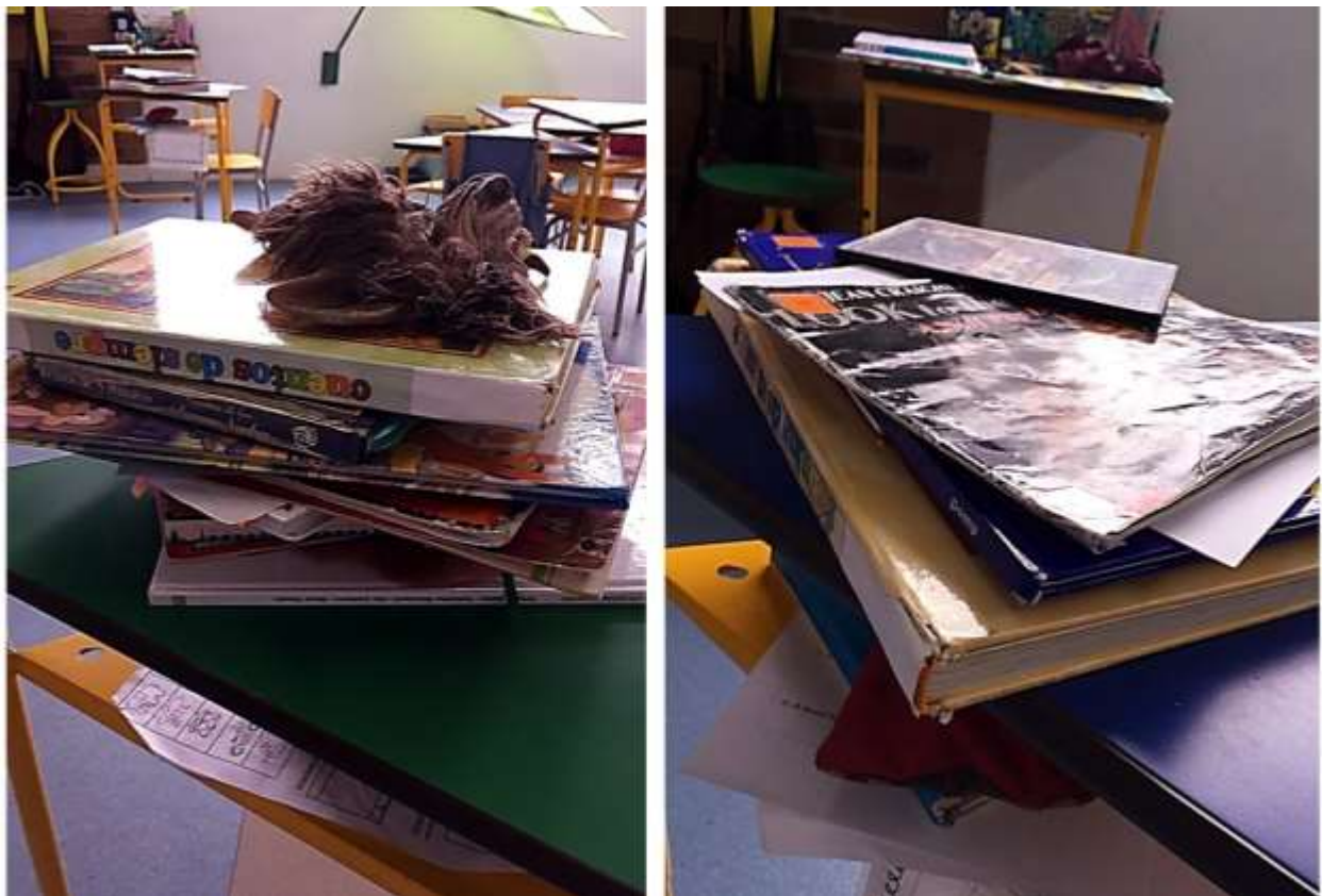
Figure 4. Students brought in texts from home that had images of wolves, then compared the amount of “bad wolf” texts (left) to “good wolf” texts (right).