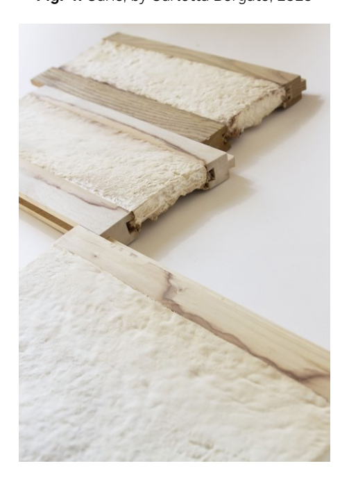
Fig. 4. Carie, by Carlotta Borgato, 2019