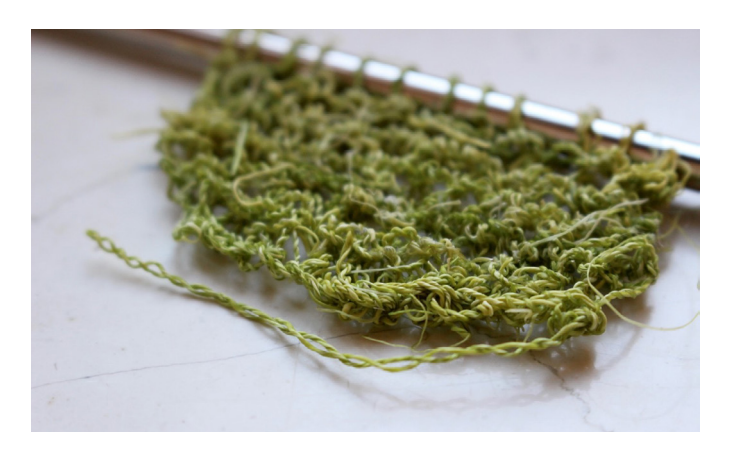
Fig. 20. Greenet material sample.