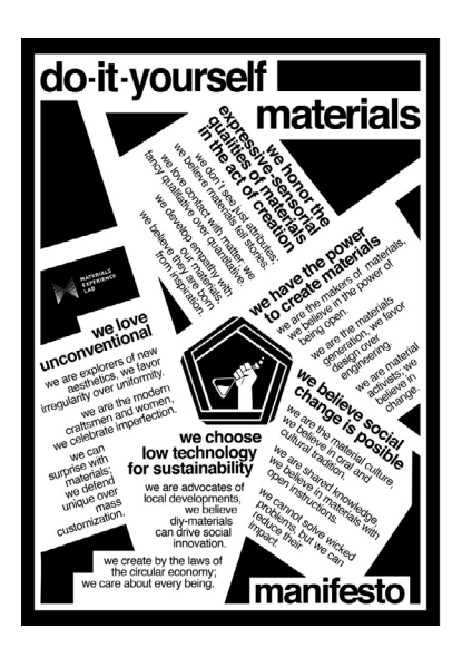
Fig 1. The DIY-Materials Manifesto