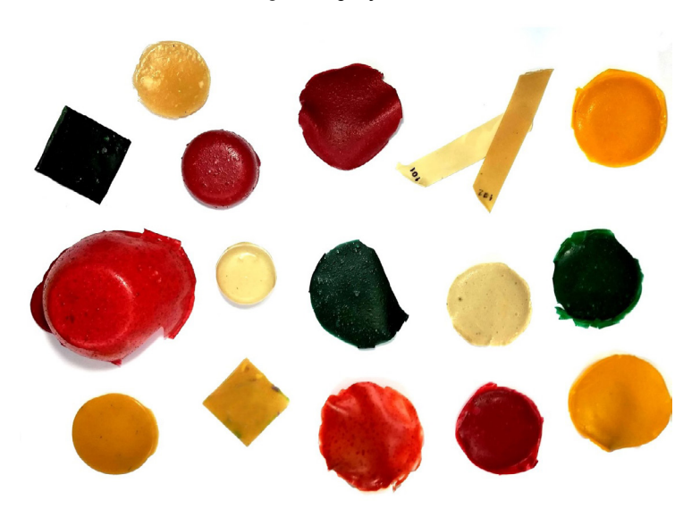
Fig 16. Pig it yourself