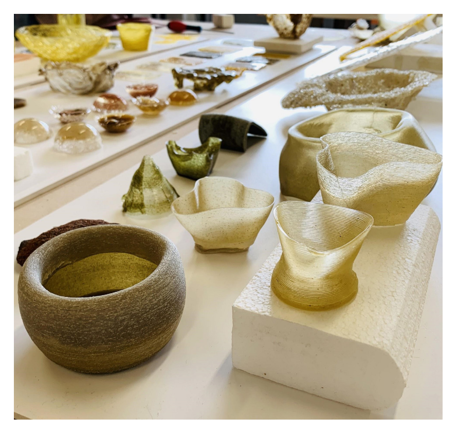
Fig. 9. some results of the workshop at Politecnico di Milano with Algae Geographies by Algae Platform, Atelier Luma. Broken Nature, Triennale di Milano.