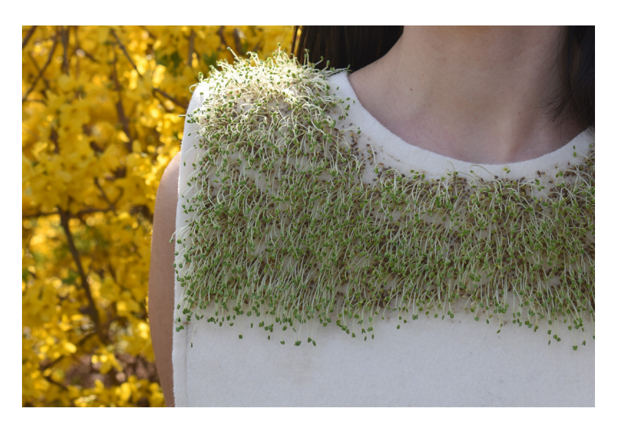
Fig. 21. ReGrowth application in clothing.