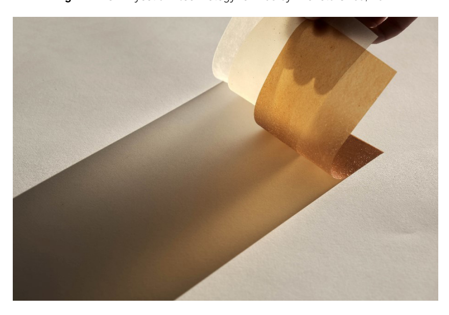
Fig. 7. MYO - Mycelium technology for kids by Michela Grisa, 2021