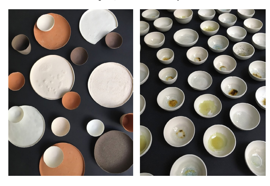
Fig. 10, 11. A Matter of Clay.