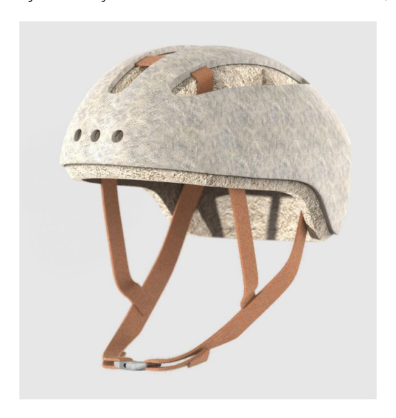
Fig. 6. MyHelmet by Alessandra Sisti with the Momo Studio, 2021.