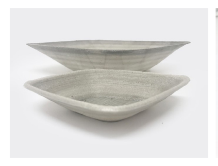
Fig. 14, 15. Development and scenario of DIY-Materials based on mussel shells.