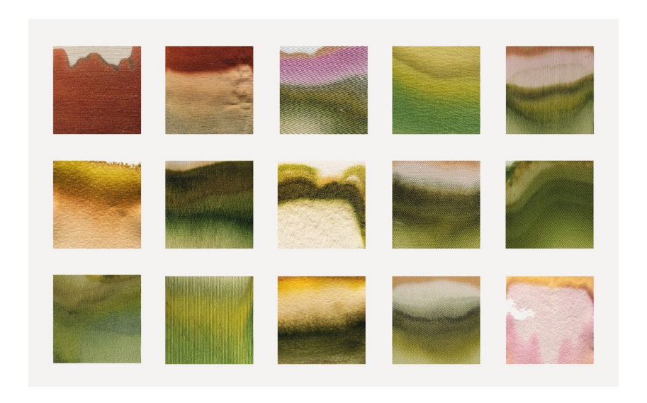
Fig. 19. Nature commands colour.