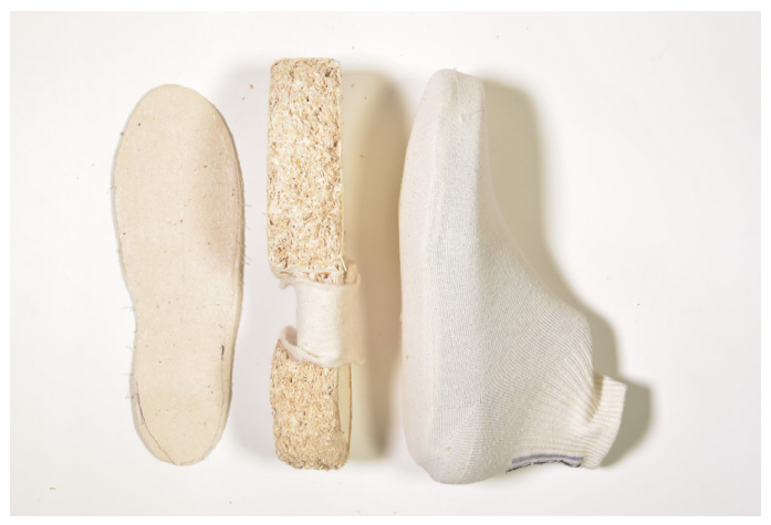
Fig. 5. Organs - organic runners by Deoshree Ravindra Bendre, 2021