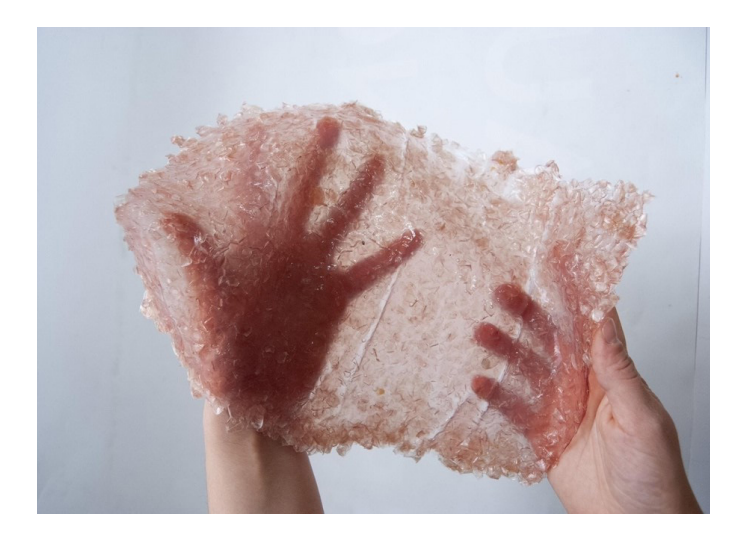
Fig 13. Fish Left (L) overs.