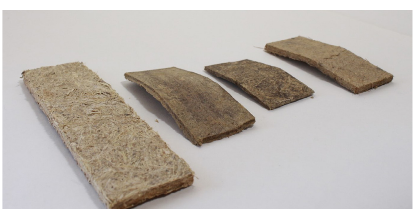
Fig. 17. Cornstalk do-it-yourself materials for social innovation.