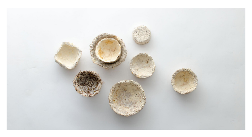
Fig. 3. A Matter of Time, by Stefano Parisi, 2015